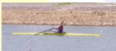
Tess Gerrand - GOLD Women's U19 Single Scull